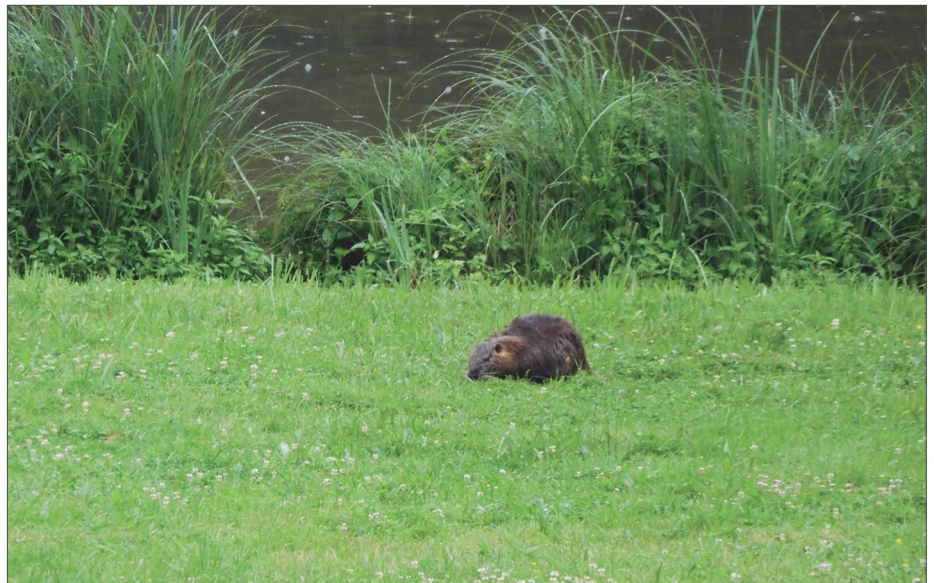
The grounds of Bonnevaux are home to a rich diversity of species

the violent turmoil of clashing opinions and judgments, this vision of beauty and its joyfulness is lost. Then the contemplation of nature cannot link us to the contemplation of the source of consciousness and to the ground of being. We burn out in the attempt to solve the ever-growing mass of problems. When they seem insoluble, we lose hope. The shaft of sunlight landing nowhere describes contemplation itself: paying attention to the no-thingness of everything, emptiness and the first of the beatitudes, poverty of spirit. In contrast, when the heart is set free from attach-