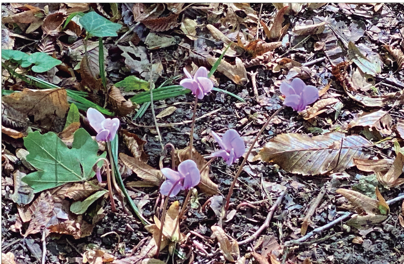
Autumn at Bonnevaux: Week after week, a profusion of cyclamen covers the woods and pathways.

ADDRESSING THE ENVIRONMENTAL CRISIS, LAURENCE FREEMAN SEES CONTEMPLATION AS THE SIMPLE PROCESS OF REPAIRING THE BROKEN CHAIN OF BEING