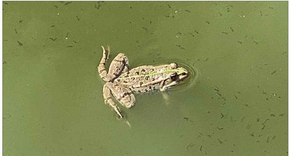
Frog on the Bonnevaux lake

The climax for Jesus was on the Cross in a moment beyond time that we cannot separate from the Resurrection. But on the Cross, planted in the earth like a tree, he released the power of compassion towards his enemies, not by saying 'I forgive you' but by connecting them to the ground of being itself: 'Father forgive them because they are trapped, tricked in their ignorance and don't know what they are doing'. Their