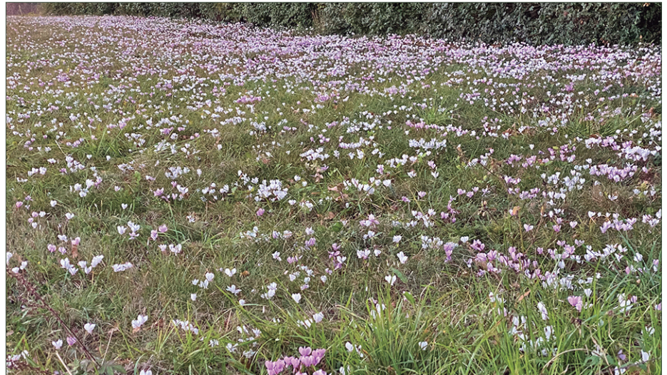
Cyclamens at Bonnevaux

After meditation this morning, a beautiful September morning, I walked in the autumn of the life cycle around the lake of Bonnevaux. The pandemic anchored me here for the past two years and graced me with the opportunity to learn more about the extraordinary wonders of the natural world that is always around us yet often ignored. As the trees change colour and the days grow shorter and the nights chillier, a profusion of cyclamen covers the woods