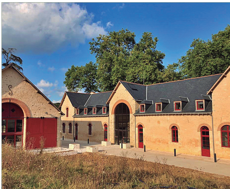
On the left, the Conference Centre (Barn) and on the right, The Retreat Centre (Guesthouse)