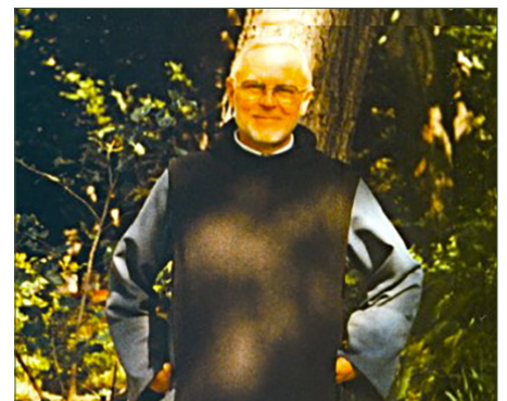
Seminar also celebrated the life and legacy of John Main