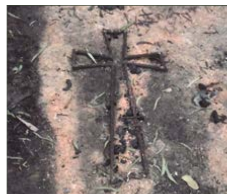
Remains of the old Cadgee church pulpit, and after the fire, the metal cross seared on the earth

tables. As a community we need to do the same. Anger, channelled as deep and persistent conviction and action, is an appropriate response to present conditions. A contemplative response is measured and spiritually intelligent but no less insistent than any form of activist protest. The times in which we are living demand radical action. Come what may though, if we lose our capacity for love, then we forfeit our Christian vocation and identity. We can only live in this broken world as truly human beings when we act with truthful and courageous love for the common good.