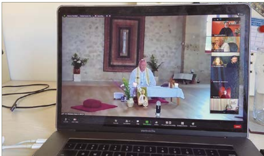
Receiving new Oblates during the online retreat