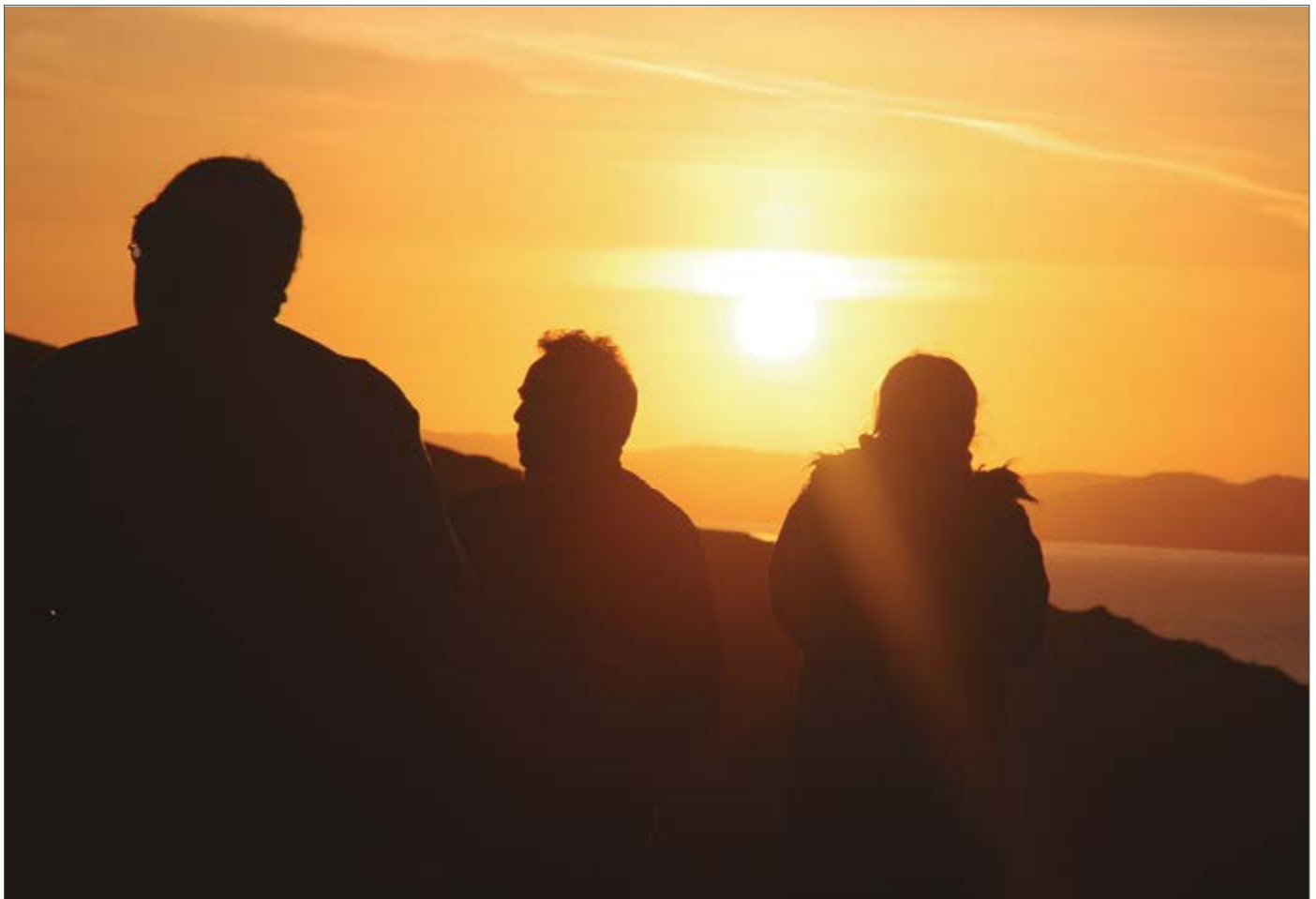
Waiting for the Easter Sunrise, a traditional contemplative practice during WCCM retreats throughout the years

IN THE LIGHT OF THE COMMUNITY ANNIVERSARY, LAURENCE FREEMAN PROPOSES A REFLECTION ON TIME - WHAT PASSES AWAY AND WHAT IS ETERNAL?