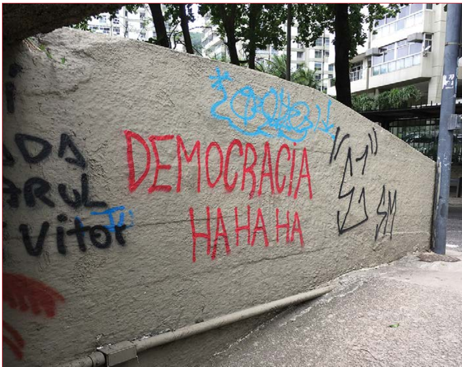
Message in a wall in a street in Rio de Janeiro, Brazil

Laurence Freeman reflects on how a contemplative life can be an antidote for the contemporary global crisis