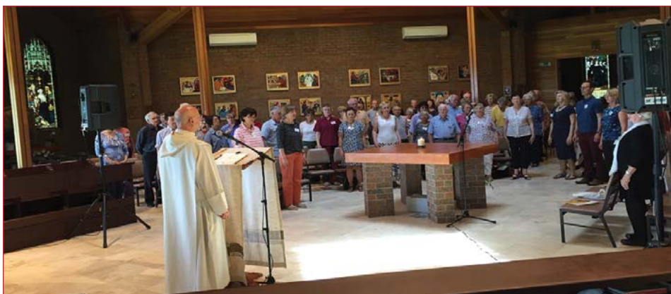
Photo of the second day of the Seminar