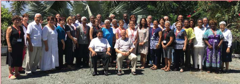
Group photo at the retreat in Tobago