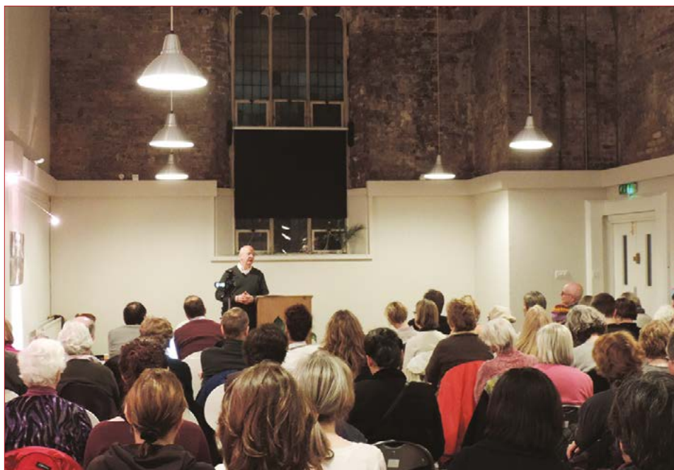
One of the regular webcasts transmitted from the London Meditatio Centre connecting the World Community

Since 2013 the Meditatio Centre has hosted retreats, workshops, talks, art exhibitions, bodywork, music for meditators from the UK and overseas (p. 6-7)