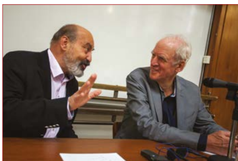
Thomas Halik and Charles Taylor

beliefs (the world was created literally as the Bible describes 10,000 years ago). Or do EU constitutional leaders refusing to acknowledge the Christian influence on European civilisation not