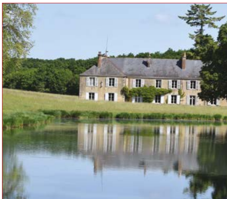
Potential new WCCM International Centre in France

When the world was going mad in the fourth century many went to the desert but not only to escape the world. In the twenty-first century we need places where people can also step aside even briefly from the whirling madness of the world to re-centre, reconnect to themselves and sustain their spiritual practice. One of the key