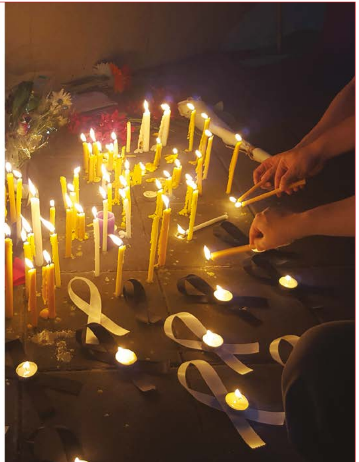
Left: Meditation during Seminar in Prague. Right: Vigil for victims of the recent shooting in Orlando, USA.